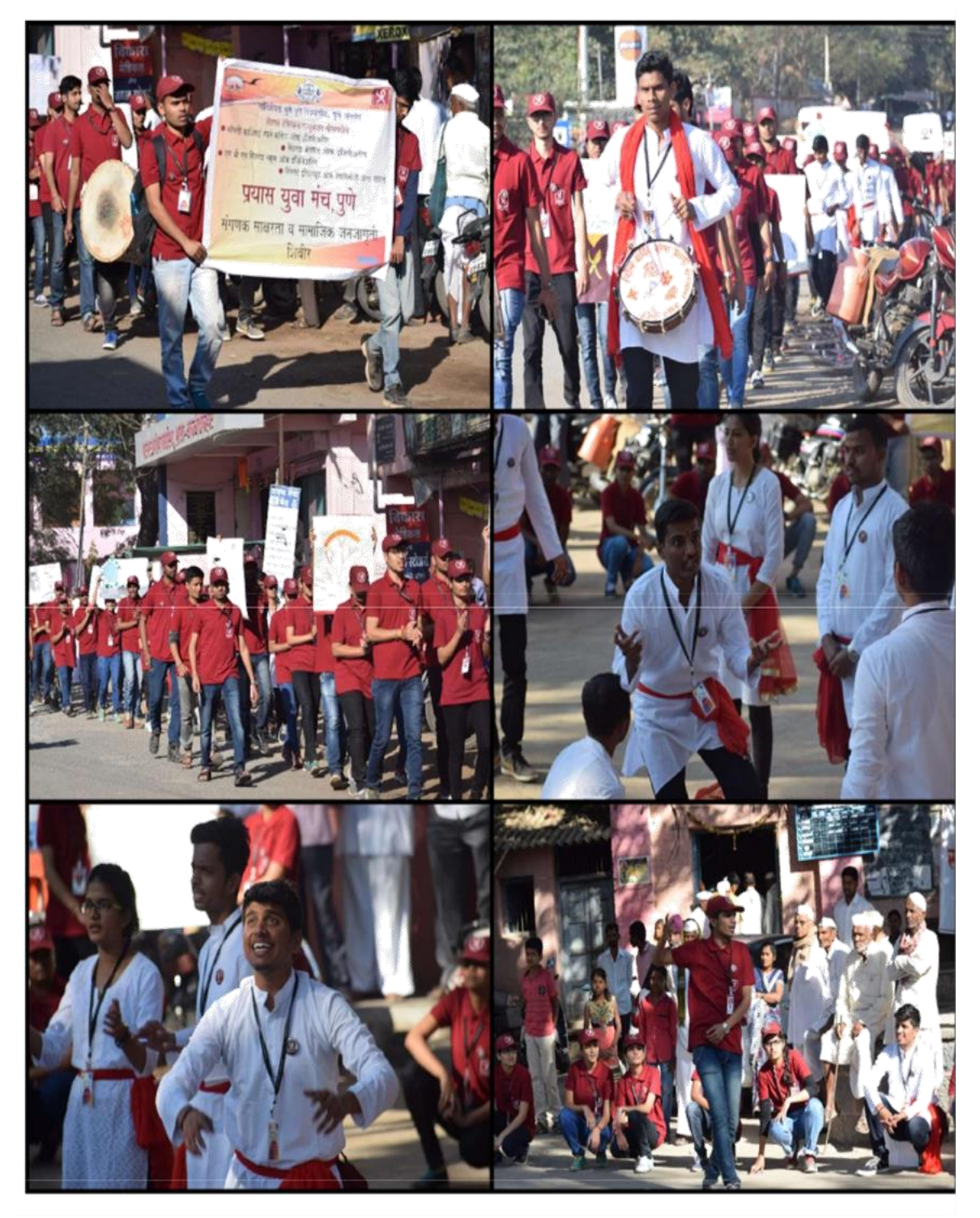
about our presence in the village

Prabhat Pheri and Davandi were organised on the second day of Camp in order to explain the schedule of Prayas camp and spread 'Jan-Jagruti' among villagers. It was to make people aware