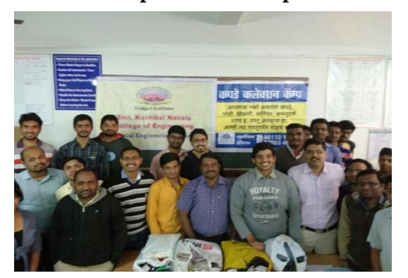
Cloth Donation 30/12/2016